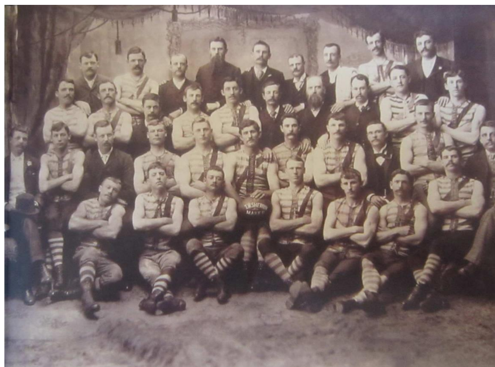
Left: The Britannia Football Club in 1891, the club's last season. Britannia wore blue and white hoops with a red sash.

The strongest of the local teams in the Collingwood area during the 1880s was Britannia Football Club. Britannia was founded in 1877 and, with Star of Carlton, were adjudged joint premiers of the Victorian Junior Football Association in 1884. Britannia had sought admission to the VFA on several occasions, but it was not considered strong enough to compete successfully in the senior competition. Many of its players were also recruited regularly by senior teams outside the suburb, particularly the neighbouring Fitzroy Football Club. However, a powerful push had developed to have a team in the VFA which represented Collingwood. During 1891 a new entity called the Collingwood Football Club was given an assurance that it would be admitted to the VFA in 1892. Britannia decided to disband early in 1892, its members reaching the conclusion that it would not be able to compete with the new club. Bitter about this turn of events, most of Britannia's players and officials threw in their lot with the Fitzroy Football Club.