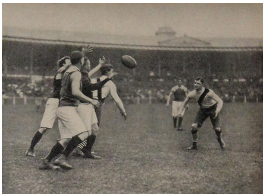
A scene from the 1909 VFL grand final. Australasian , October 9, 1908.

Although South Melbourne had won five premierships in the VFA (1881, 1885, 1888, 1889 and 1890), it was not until 1909 that South won its first League flag. That year South faced Carlton in the grand final at the MCG before a crowd of 37,759. South were the minor premiers, and although Carlton had defeated them by 22 points the previous week, they had the right to meet Carlton again to determine the VFL premiership in a grand final. From the opening bounce, South used their superior pace and the open MCG spaces to avoid the physical clashes that found them wanting one week earlier. The scores were tight throughout, with nothing separating the teams at quarter and half times, and South holding a seven point advantage going into the final term. Although Carlton pegged one goal back in the last quarter South held on to win by two points, 4.14 (38) to Carlton's 4.12 (36).